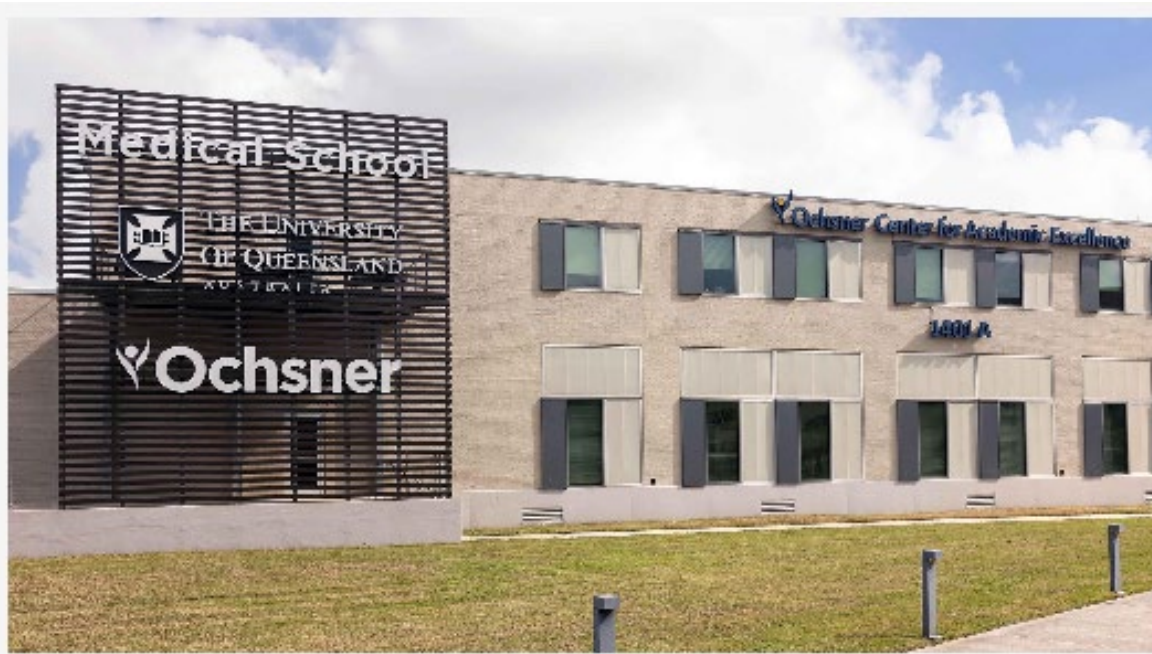
Years 3 and 4

medical-school.uq.edu.au/ochsner-years-3-and-4