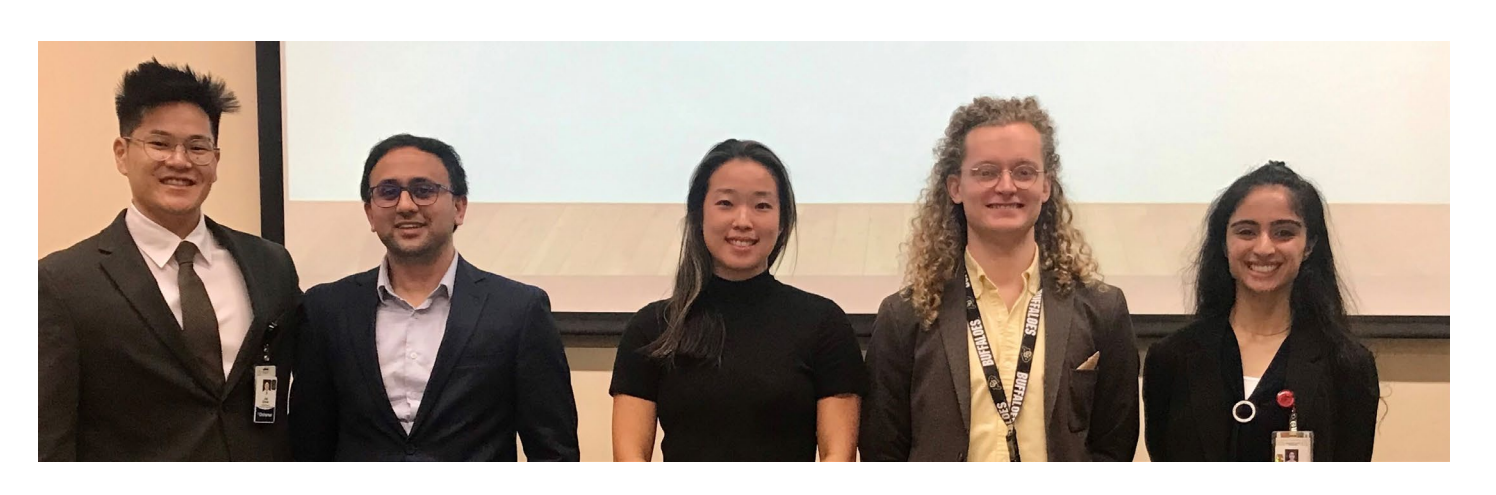
21st Annual Ochsner Health Research Week

Liver-Directed Therapy Modality-Specific Outcomes Controlling for Index Tumor Size in Early- to Intermediate-Stage Hepatocellular Carcinoma